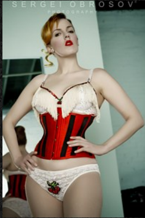
Your first corset